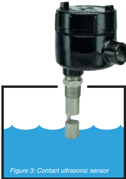
Figure 3: Contact ultrasonic sensor

used for either point or continuous level measurement. A probe inserted into the fluid tank senses the material level changes. These changes are electronically conditioned into retrospective capacitive and resistive values, and are further processed and converted into an analog signal. The probe and the vessel wall form the two plates of a capacitor, with the liquid medium serving as the dielectric. The signal is generated only from true level changes, thus rejecting the unwanted effects of material built-up on the probe. Note that for a non-conductive fluid vessel, special systems utilizing either dual probes or an external conducting strip may be required. The sensing probe may be constructed from different materials, with either a rigid or flexible design. The most common design is a conducting wire insulated with Teflon®. A stainless steel probe is also available for applications where greater probe sensitivity is necessary. For example, low dielectric or non-conductive fluids (dielectric constant under 4) or granular fluids require the stainless steel probe. The flexible probes are used when there is not enough overhead clearance for the rigid probe, or in applications requiring the longer length. The rigid probe provides higher stability, especially in turbulent systems. If the probe sways to and from the vessel wall, the signal from the probe may fluctuate.