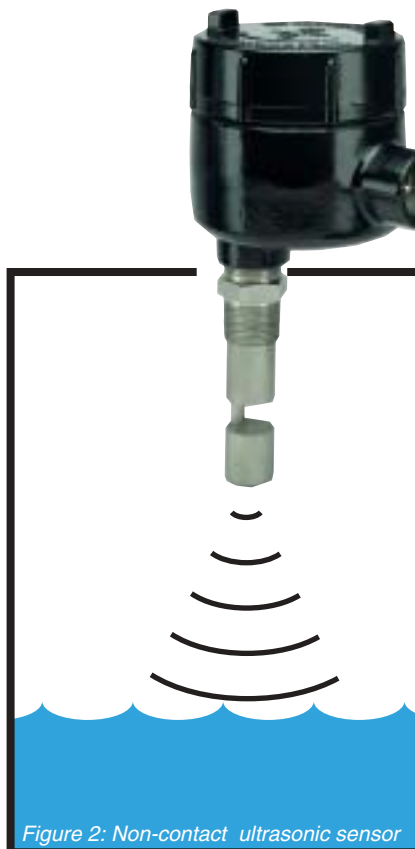
Figure 2: Non-contact ultrasonic sensor

When the averaged value from the microprocessor coincides with the BCD switch setting, the microcomputer energizes an output relay, for either high or low level indication. A momentary loss of signal from the sensor will not change the output status; the microprocessor's memory retains the last valid value. However, a signal loss for more than 8 seconds will cause the relays to de-energize and return to original state. A fixed half-second time delay is incorporated into the electronics to minimize the effects of surface turbulence and agitation on the unit's output.